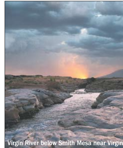
Virgin River below Smith Mesa near Virgin