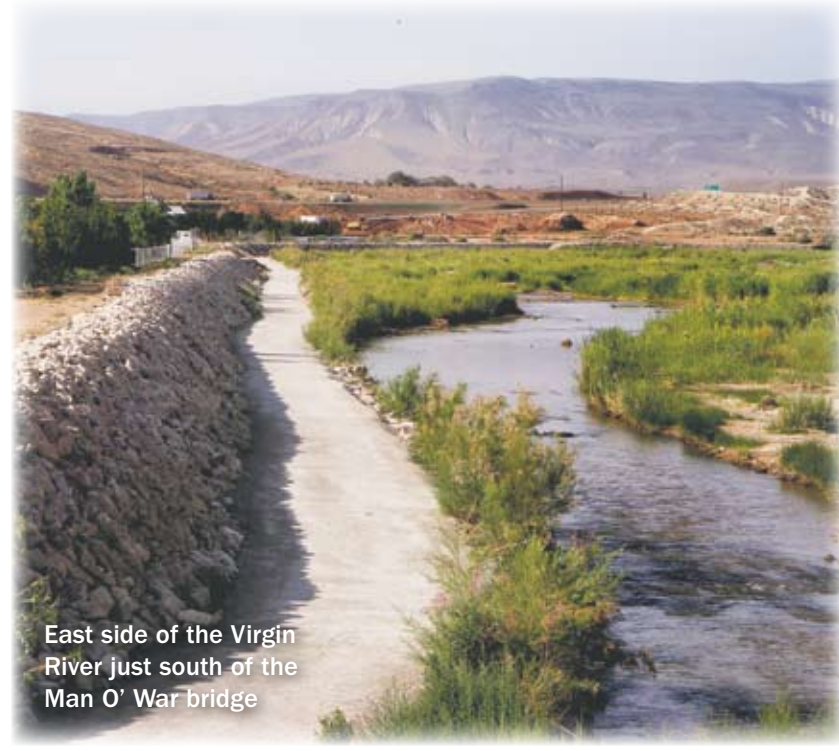
East side of the Virgin River just south of the Man O' War bridge