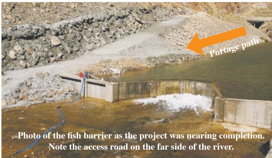
Photo of the fish barrier as the project was nearing completion. Note the access road on the far side of the river.

Once again, cooperation between the Program that paid for the barrier and the District that managed the project, has yielded a solution to a problem that could threaten the progress of endangered fish recovery in Washington County.