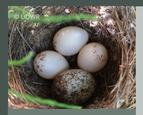
One speckled Brown-headed Cowbird egg in a Southwestern Willow Flycatcher nest