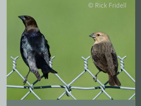
Brown-headed Cowbird female (right) & male (left) are brood parasites that provide no parental care

Brown-headed cowbirds are brood parasites that lay eggs in other species' nests. Cowbird nestlings will outcompete flycatcher young, which often causes nest failure . Since 2013, hundreds of cowbirds have been trapped and removed from flycatcher breeding sites, resulting in a significant increase in nest survival of flycatchers and many other riparian bird species.